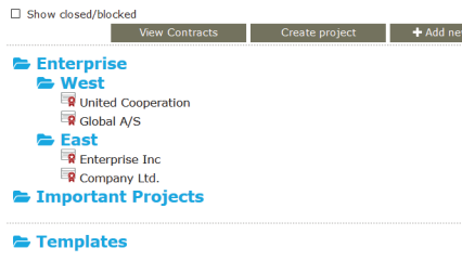
Setup of cross project statistics